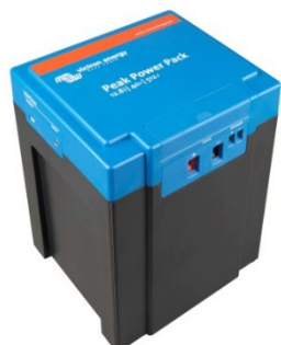
12.8 V, 40Ah