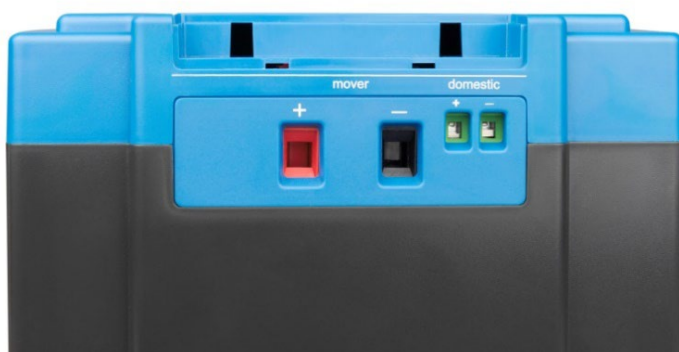
High capacity output (mover) and low capacity output (domestic)