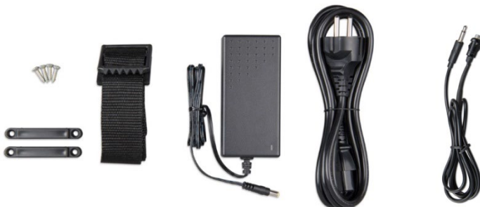
Fixing strap Adapter Power cable Push-button with cable (2m) and dual-colour LED