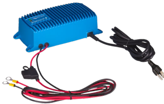
Blue Smart IP67 Charger 12/25